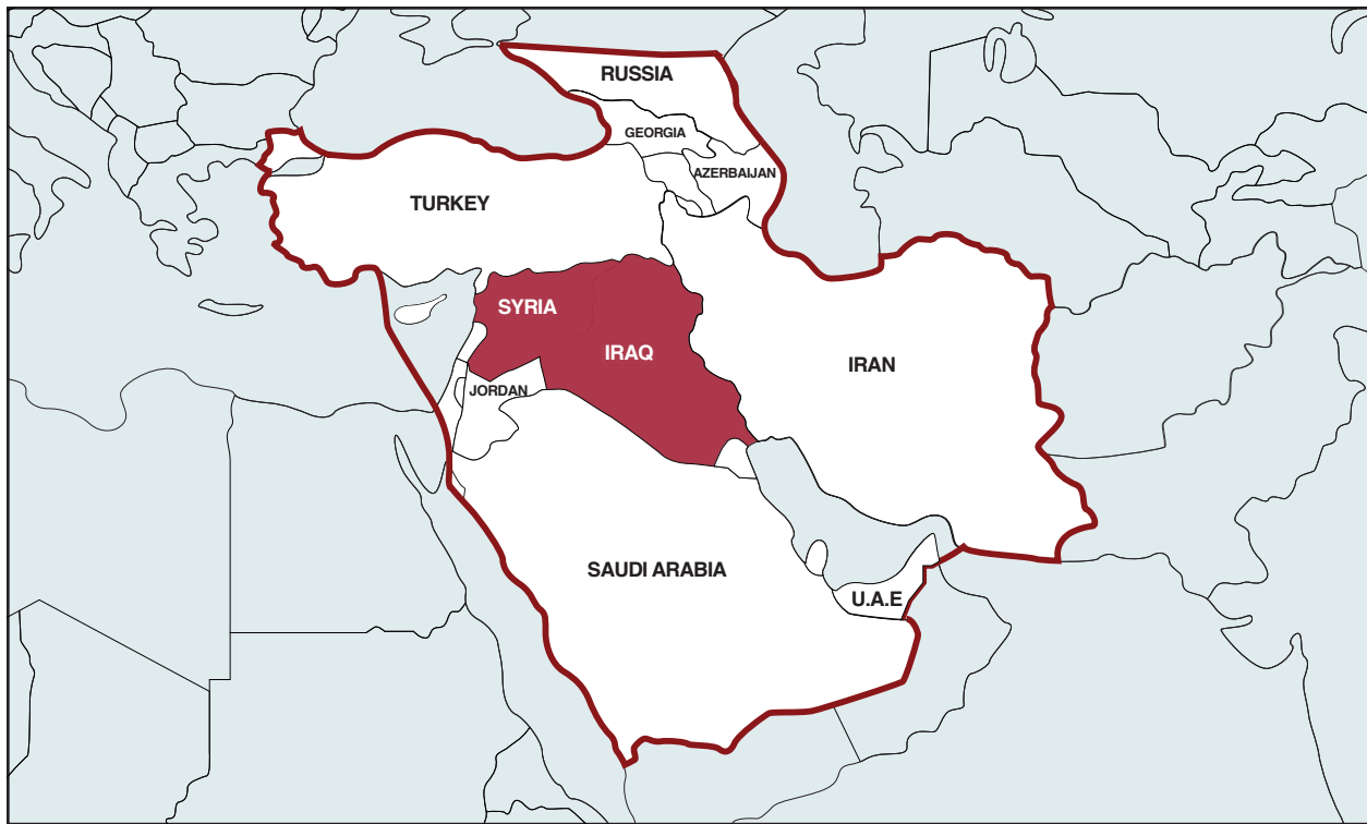
Figure 4. Region for the Main Effort